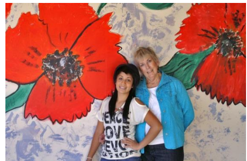
A youth and her mentor painted this wall.

December – Taking Action & Overcoming Challenges